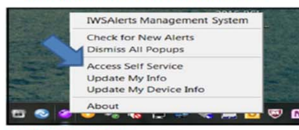
certificates pop up.

click and select "Access Self Service". *** Pick your email certificate when the